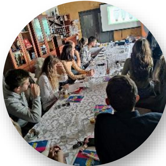
Educational materials on air quality