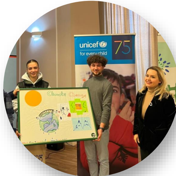
Youth Manifesto for air quality and climate change