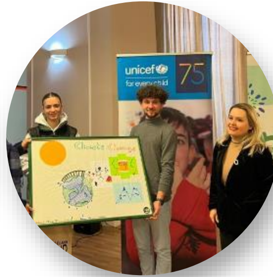
Air & Climate watchdogging techniques in local communities