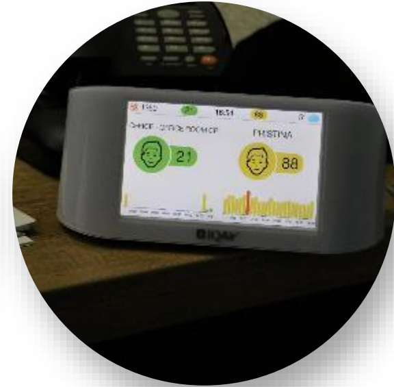
Demonstrating the use of digital technology to understand air quality data