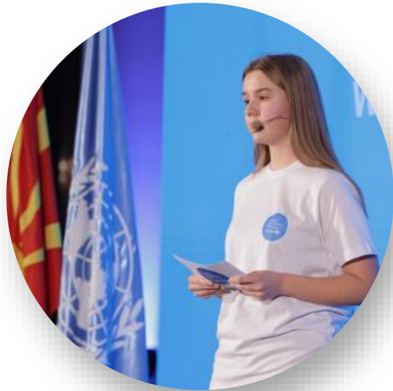
Youth Climate Declaration on creating space for young people in municipalities and the Government