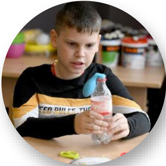
Children learn about climate change and build scientific curiosity through experiments