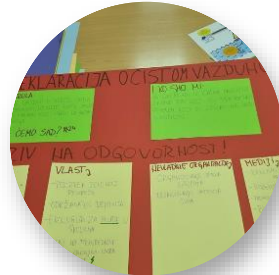
Youth Declaration on preserving clean air in the Republic of Serbia