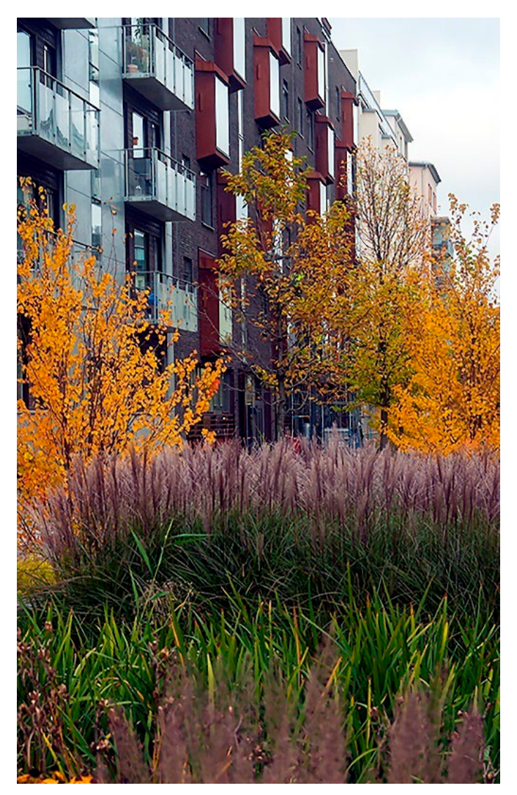
Plant bed for managing stormwater, Sweden.

Evidence suggests that stormwater is the main dispersion pathway for microplastics to enter the environment. According to Tumlin & Bertholds (2020), based on this assumption, more than 100 times more microplastics could be added to the recipient via stormwater compared to outgoing treated wastewater. According to IVL Swedish Environmental Research Institute's mapping of sources of microplastic releases and dispersion pathways, stormwater accounts for dispersal of most microplastics from tyre and road wear, synthetic sports surfaces, industrial production and handling of primary plastics, surface treatment and painting of buildings, and litter (Magnusson et al., 2017). Surface runoff also serves as an important dispersion pathway for macroplastics — plastic fragments larger than 5 mm (Swedish EPA, 2021b).