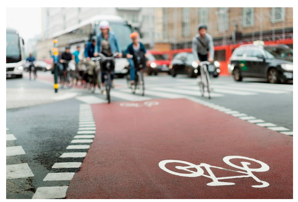
Road markings on a bicycle path/road in Stockholm.

Innovations that lead to the development of collection systems for use while driving could also help reduce microplastic leakage.