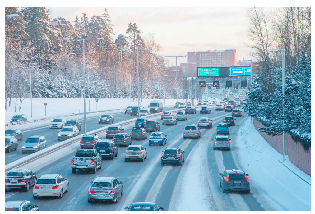
Rush hour traffic in Stockholm.