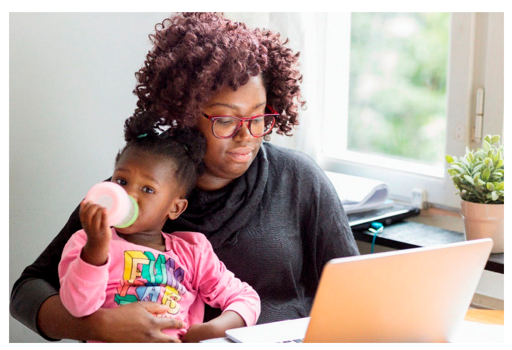
Plastic baby bottle