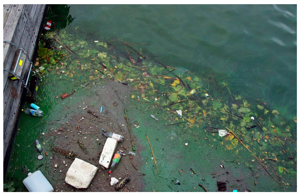
Plastic litter in Årstaviken, Swedish EPA.

The research agenda includes the breakdown of litter into microplastics but not the causes of litter entering the environment. As a result, the obstacle "lack of solutions to reduce leakage of microplastics from certain flows" is not addressed for this source of microplastics. The obstacle "assessment of environmental and health risks of microplastic releases" is covered by what is stated in Chapter 3.1.1.