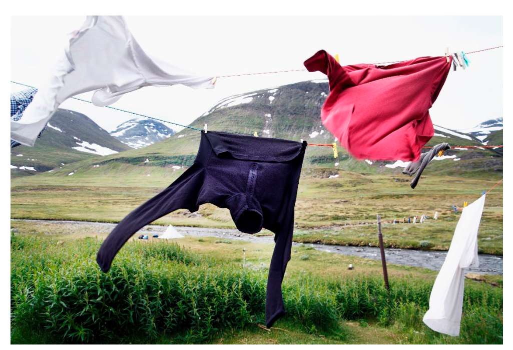
Clothing made of synthetic materials.