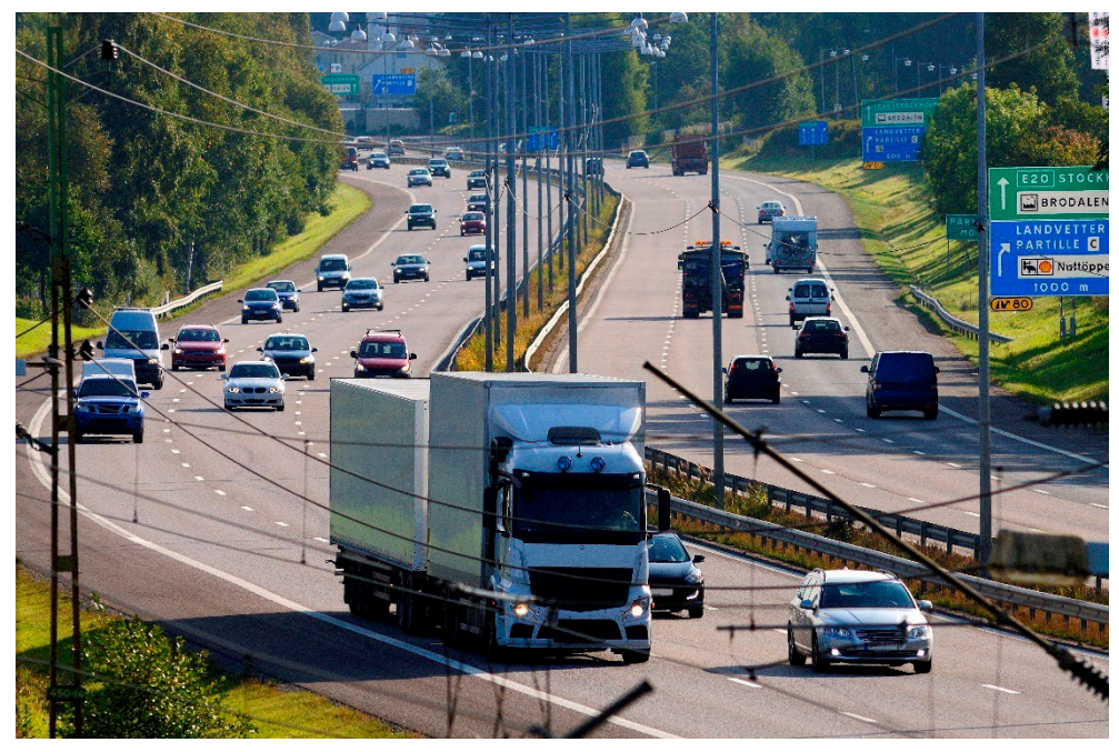
Traffic outside of Gothenburg.

Efforts to reduce the leakage of tyre and road wear particles should focus on achieving improved tyre quality and durability and on reducing the releases of particles from this source through reduced wear of tyres and road surfaces, including road markings. Work should also focus on the link between particulate matter releases and hazardous substances and on improving the management of microplastic leakage through runoff.