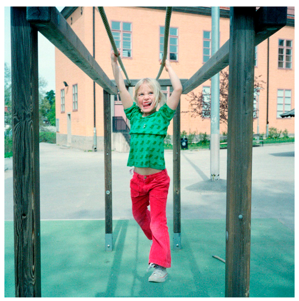
Fall protection made of rubber, Mälarhöjden School.

Efforts to reduce leakage of microplastics from synthetic sports surfaces and other outdoor sports and play facilities should focus on minimising these releases, while ensuring that factors such as play characteristics and safety are not compromised. Efforts to tackle leakage at the source should be prioritised. The obstacle "health and environmental risk assessment" is covered in Chapter 3.1.1.